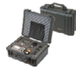
Pelican carrying case