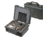
Pelican carrying case